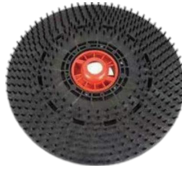
19" Magnetic Scrubber Holder